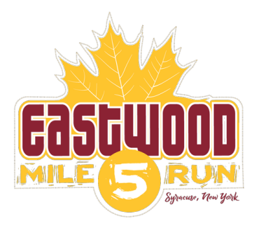
www.eastwoodrun.com early registration only $30